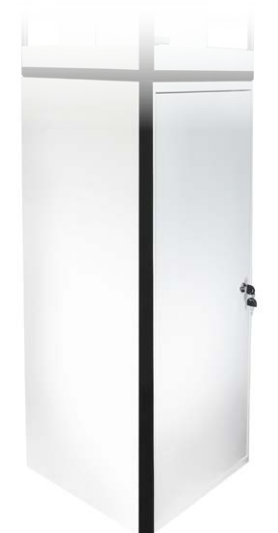
Optional Locking Base for 24-Piece Display

Display near bebe product alongside various bebe visuals for greater brand visibility.