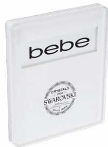
bebe Swarovski® Logo Block